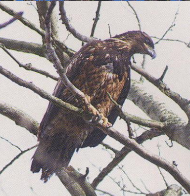
1st winter (juvenile)