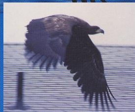
2 nd winter