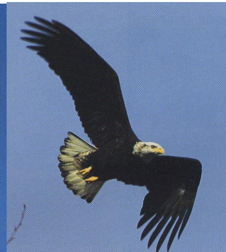
4 th winter