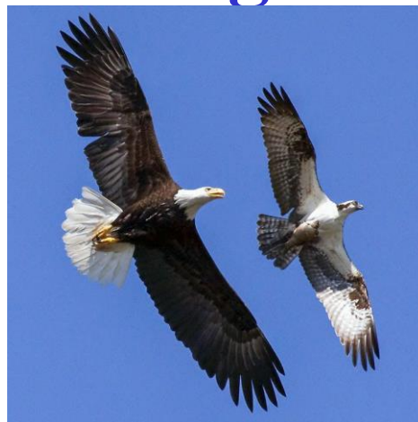
Eagle - Osprey