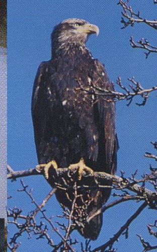
3 rd winter